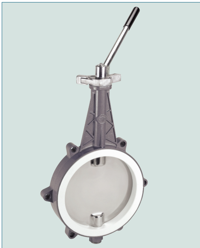
Container valve BE 250 with drain bolt lock